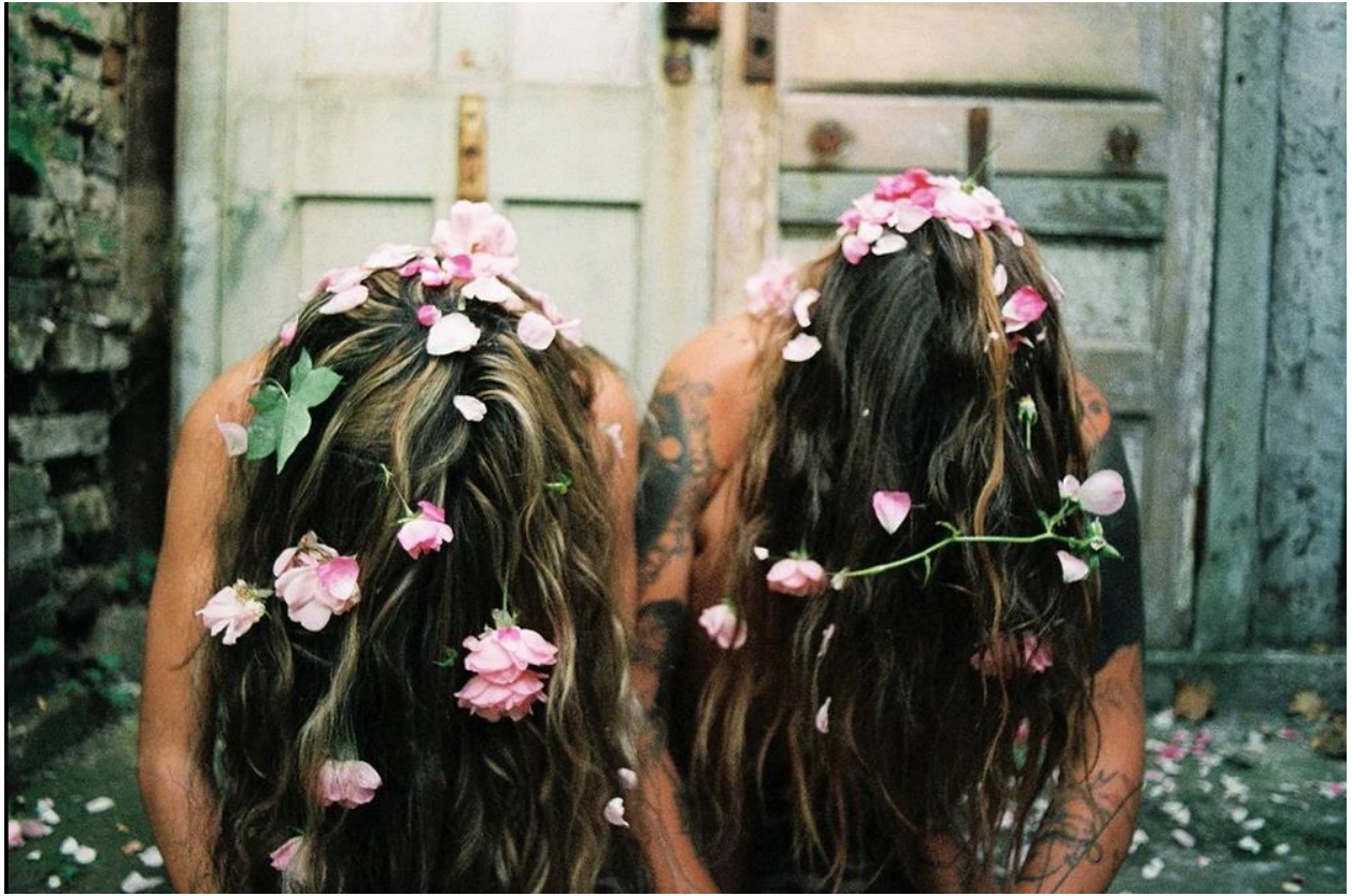
Kali Spitzer Bloom, 2019 35 mm Film-fineart Baryata Print/ 16" x 24" NFS