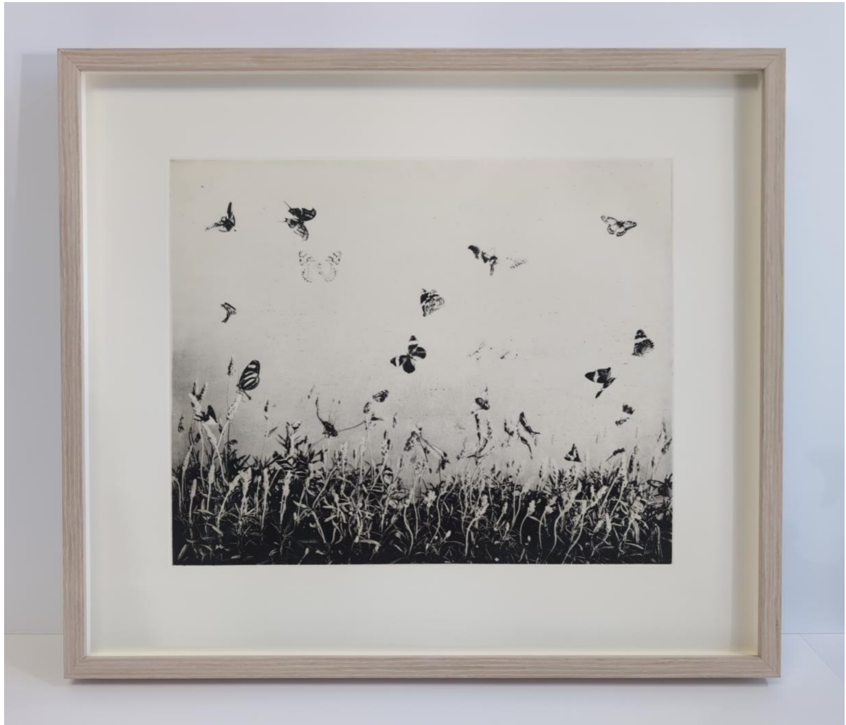
Whitney Lewis-Smith Lavanda(Heliogravure edition), 2024 Photogravure and cine collé print on Kozo-Shi paper 23''X26.25" (framed) Edition 4/6 $3,150