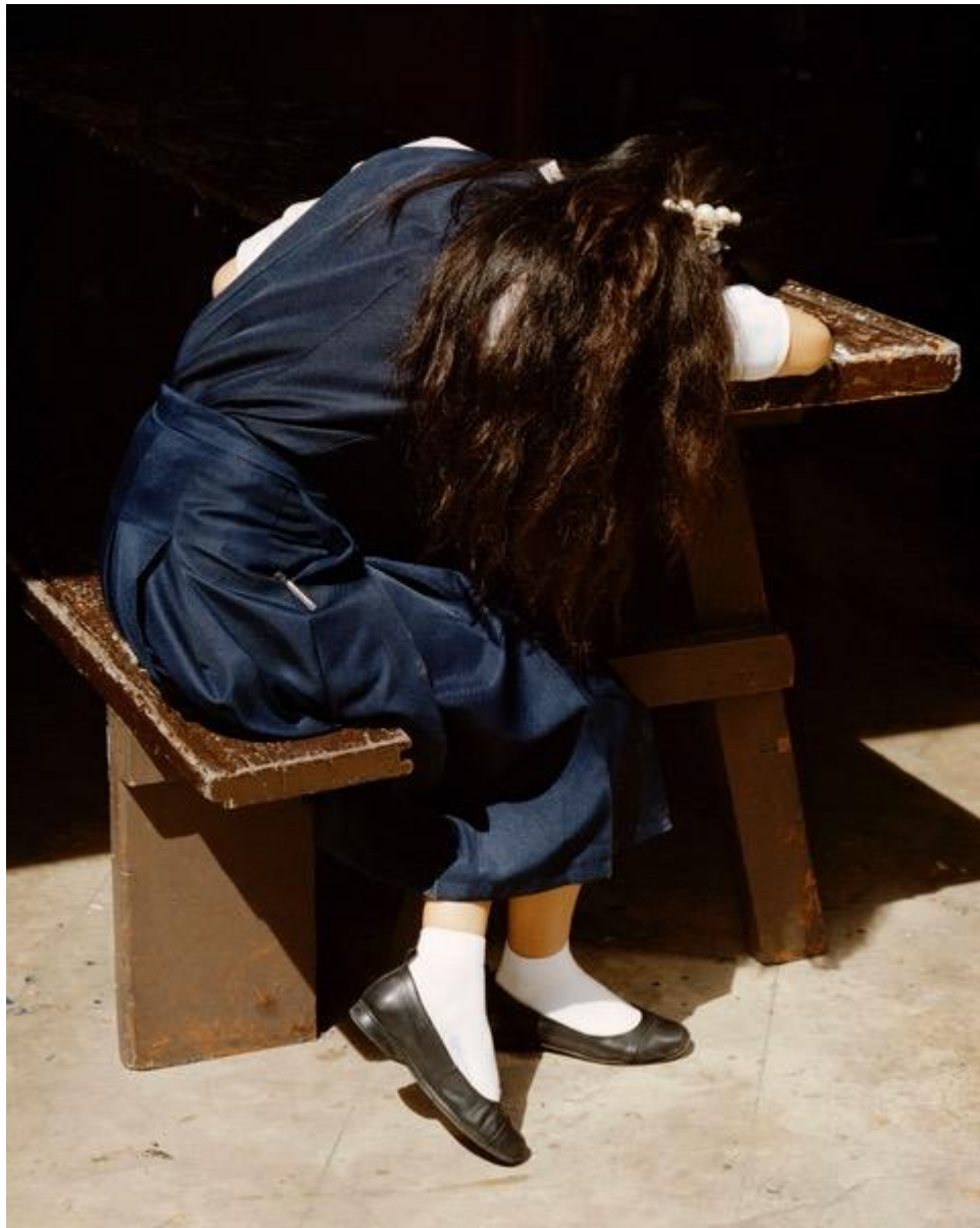
Rydel Cerezo Day Sleeper, 2026 Mounted archival pigment print with ebonized bloodwood frame Ed. of 3 + 1AP 30 x 24 in $2,500