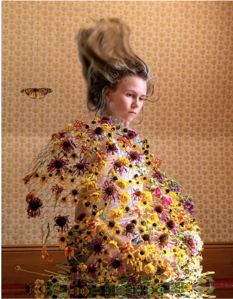
Sage Szkabarnicki-Stuart My Room, 2017 Archival pigment print. Ed. 8/10 24x30" $1,200