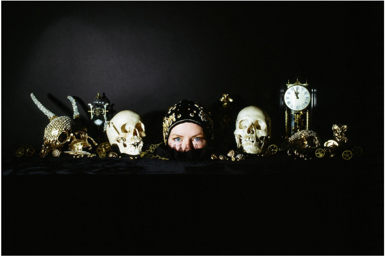
April Winter Things I Must Endure (T.I.M.E.) Pentax 645/28mm/Ektachrome 100e 24x36 inches Edition 1/3 $1,200