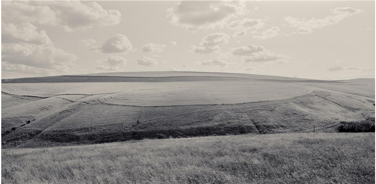
Susan Huber Patit Road, 2026 Inkjet print 18 x 38.5 inches $2,200