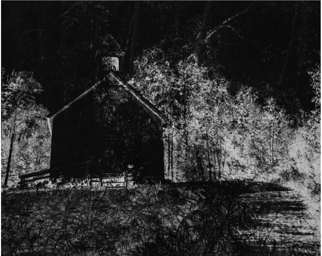
Dawna Mueller, St. Irenaeus, Thicket Portage, 2022 Silver Gelatin Print Multiple Exposure Negative Print. 40 x 50 cm