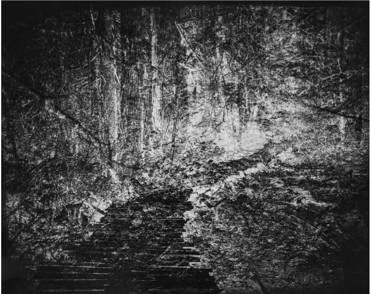
Dawna Mueller, The Journey Home , 2022 Silver Gelatin Print Multiple Exposure Negative Print. 40 x 50 cm