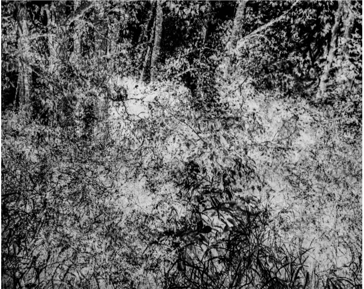
Dawna Mueller, The Homestead in Thicket Portage I , 2022 Silver Gelatin Print Multiple Exposure Negative Print 40 x 50 cm