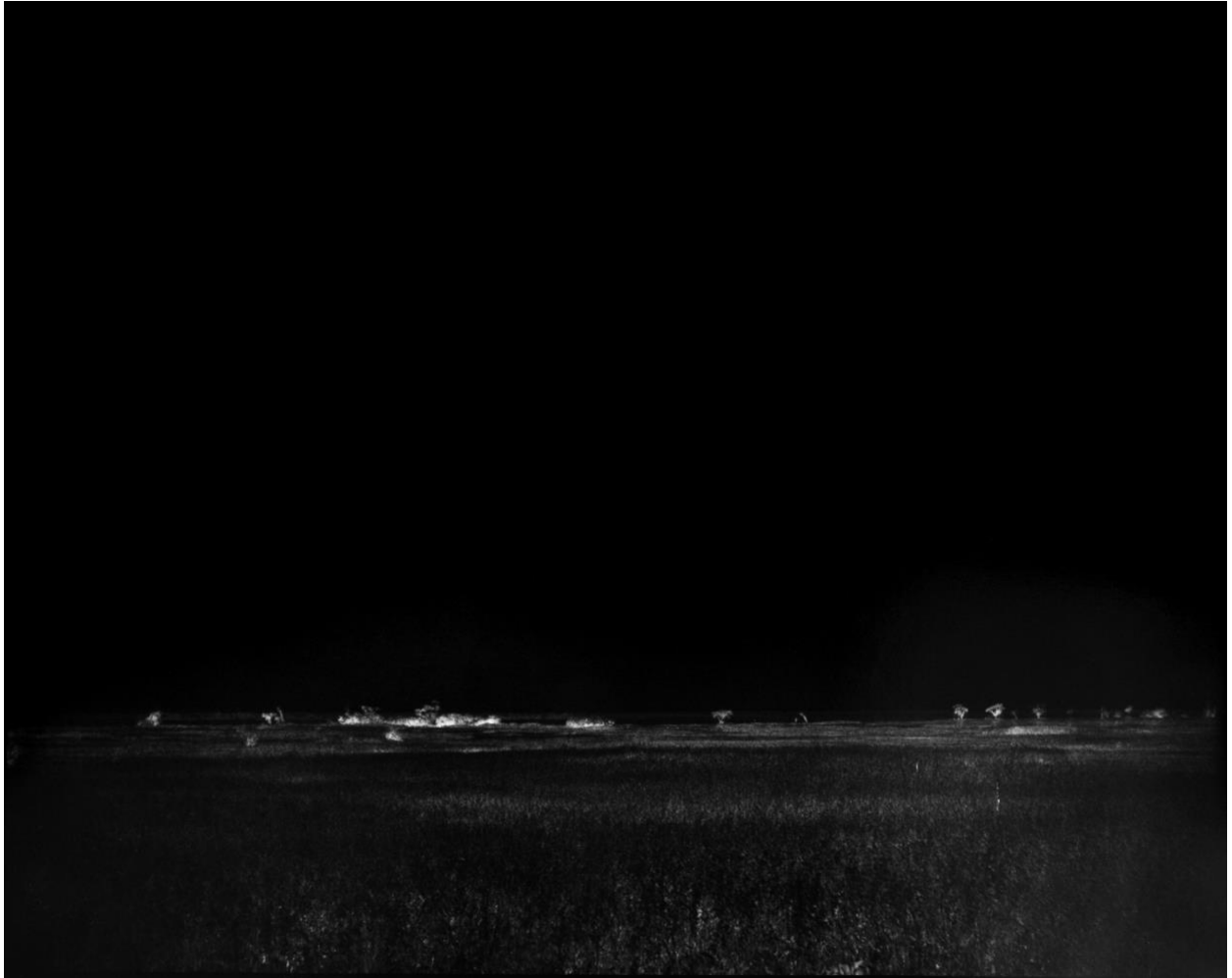
Dawna Mueller, Scan Camperville Landscape, 2022 Silver Gelatin Print Multiple Exposure Negative Print. 40 x 50 cm