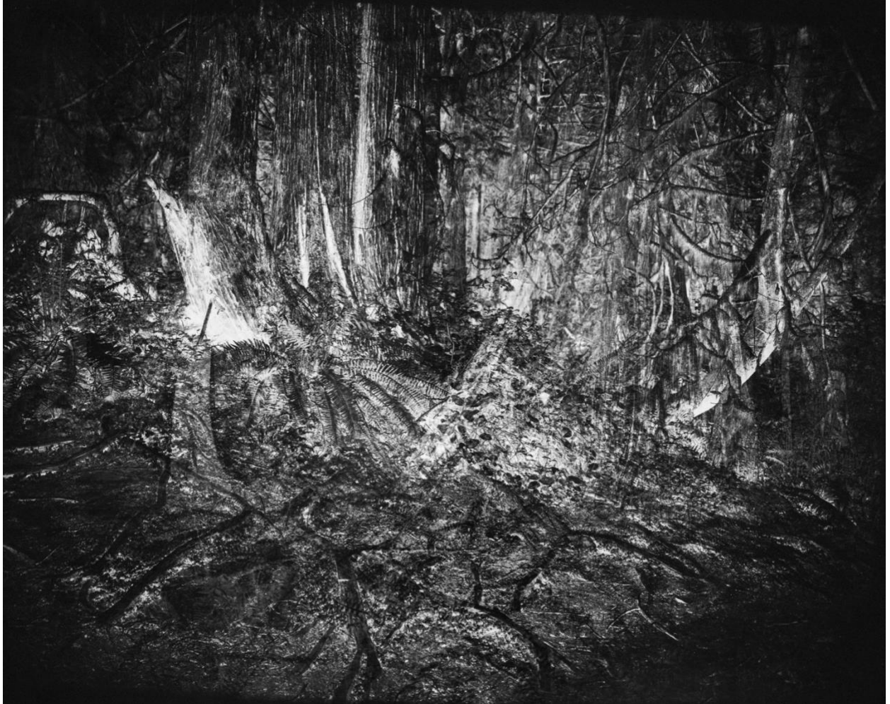
Dawna Mueller, Roots , 2022 Silver Gelatin Print Multiple Exposure Negative Print 40 x 50 cm