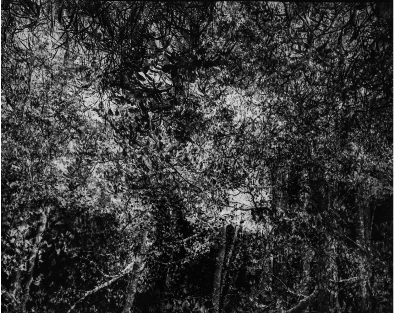
Dawna Mueller, The Homestead in Thicket Portage II , 2022 Silver Gelatin Print Multiple Exposure Negative Print 40 x 50 cm.