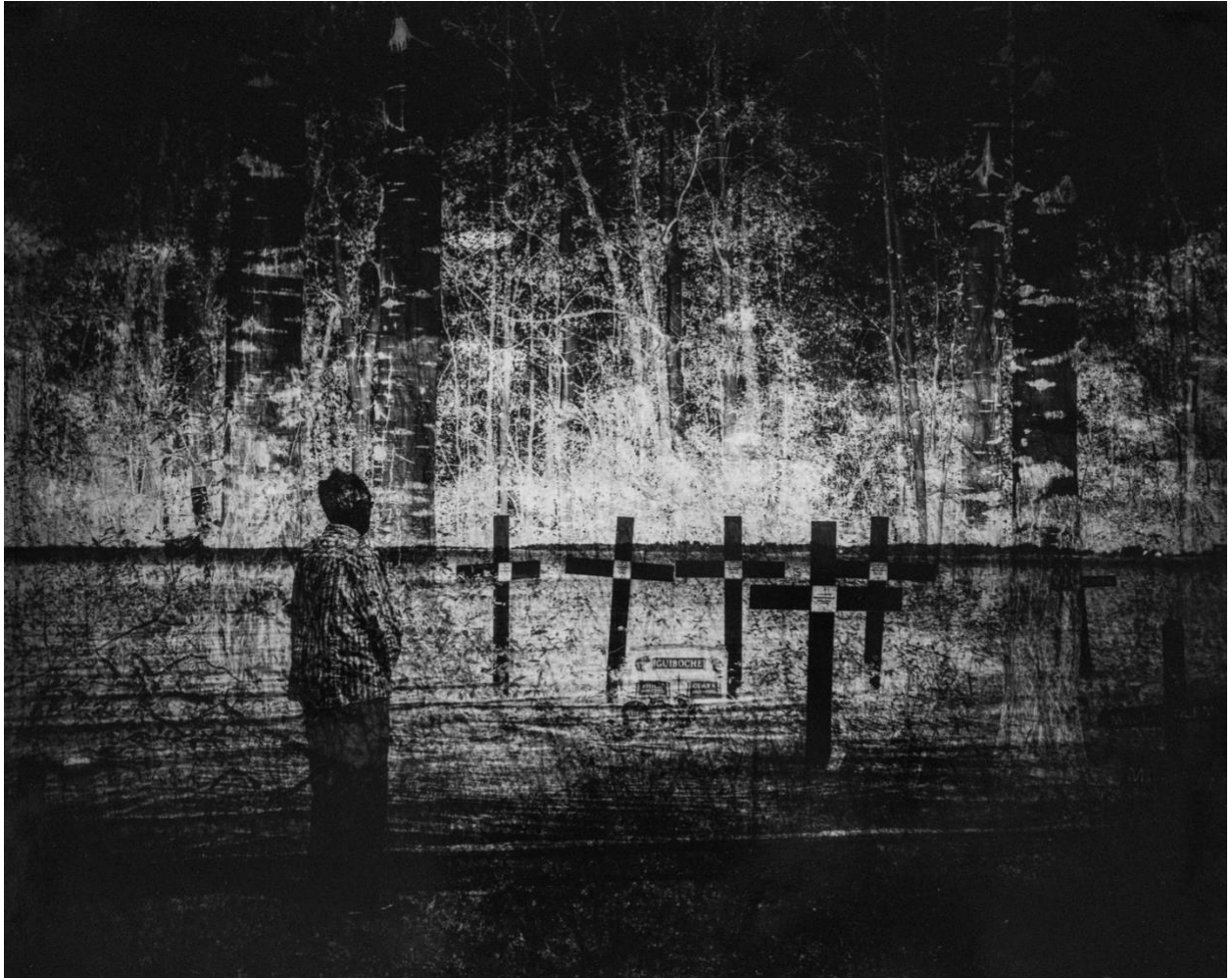
Dawna Mueller, Generations , 2022 Silver Gelatin Print Multiple Exposure Negative Print. 40 x 50 cm