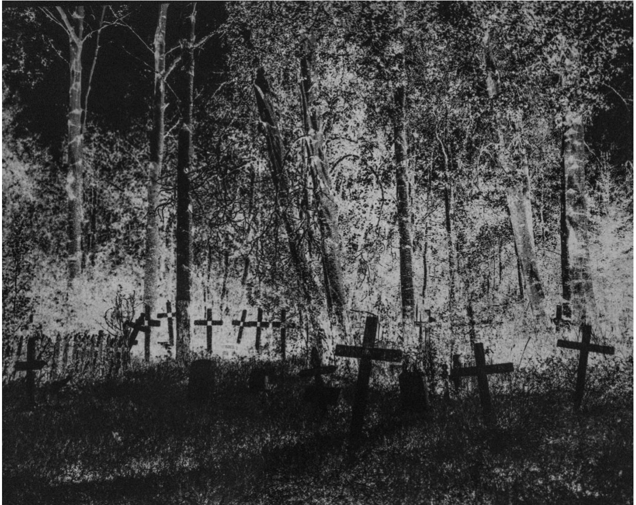
Dawna Mueller, Family Cemetery, Thicket Portage, 2022 Silver Gelatin Print Multiple Exposure Negative Print. 40 x 50 cm.