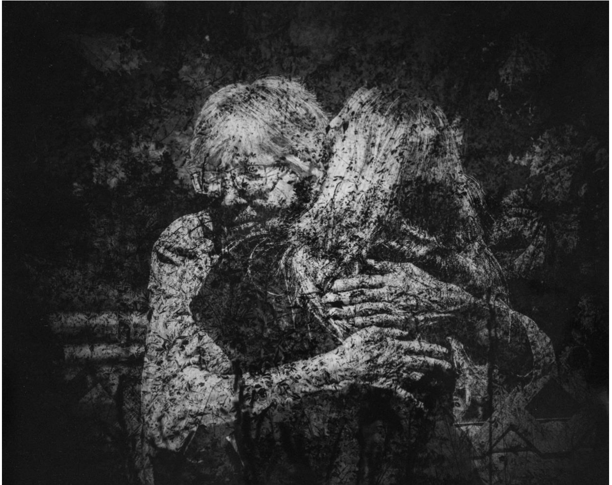
Dawna Mueller, Reunited , 2022 Silver Gelatin Print Multiple Exposure Negative Print. 40 x 50 cm