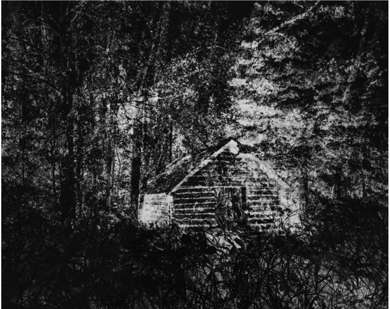
Dawna Mueller, Fish Camp, Thicket, Portage, 2022 Silver Gelatin Print Multiple Exposure Negative Print. 40 x 50 cm