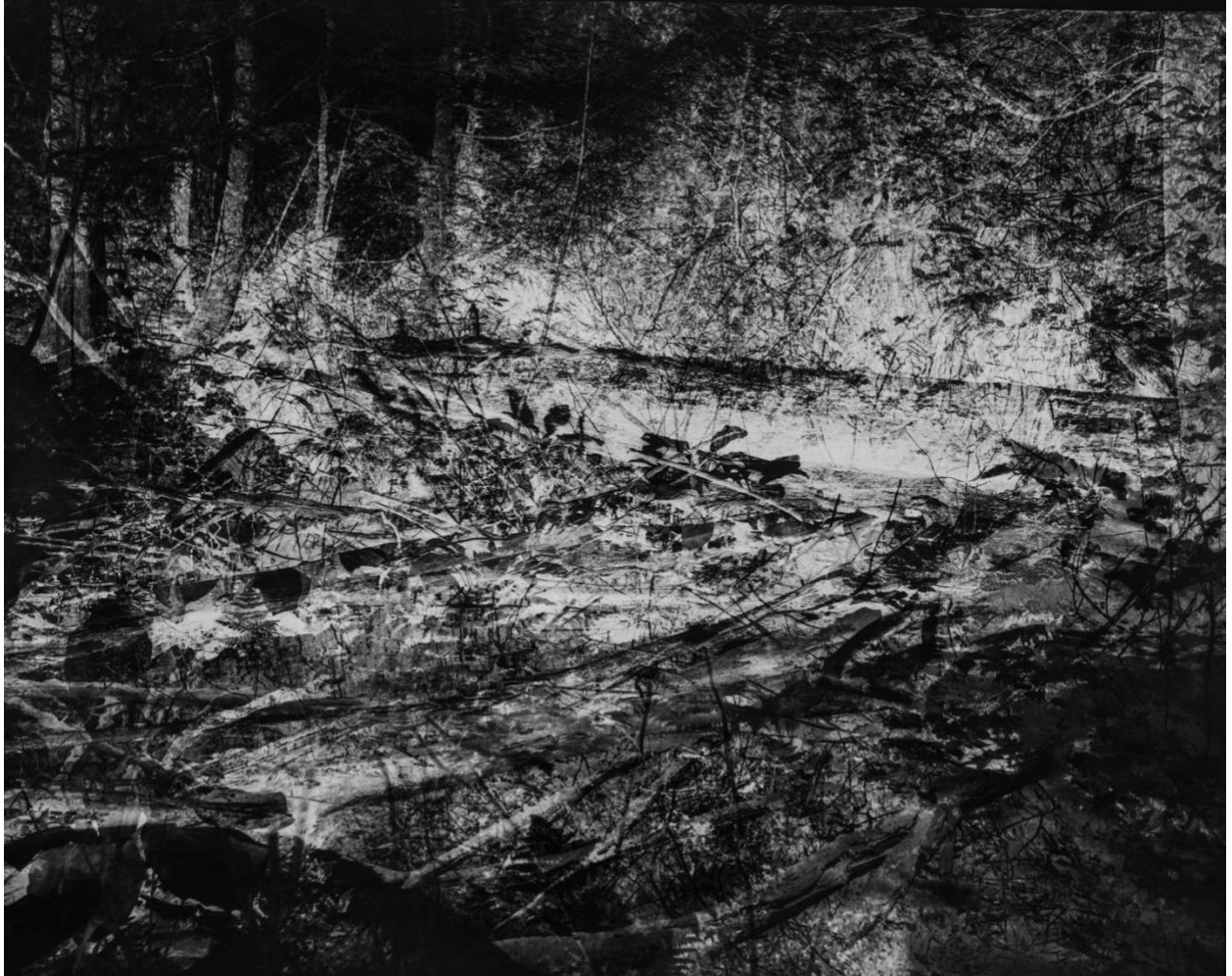
Dawna Mueller, Back Yard , 2022 Silver Gelatin Print Multiple Exposure Negative Print 40 x 50 cm